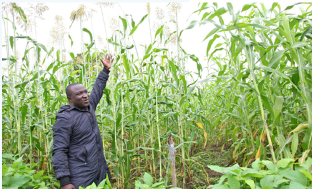
UNDP Bénin: Climate resilient short cycle crops piloted in Benin - Photo by Giacomo Pirozzi.

LoCAL focuses on the delivery of three outputs that will directly contribute to increasing local governments' access to climate finance and building resilience to climate change: Output/Result 1: CCA is mainstreamed in local government's planning and budgeting systems. Output/Result 2: Increased awareness and support for the role of local government in CCA. Output/Result 3: Increased amount of finance available to local governments for CCA and resilience.