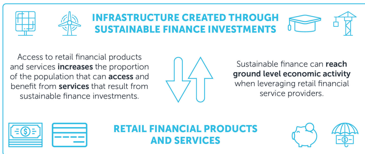
Figure 2 | Financial inclusion increases access to services, required for the SDGs

To reach the required scale and impact, sustainable finance requires increased reach and impact at the retail level, within the real economy. This means being able to reach