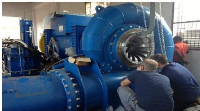
Figure: New 500KW turbine awaiting installation at AHEPO

Availability of reliable energy have increased connections to 889 households from current 210. Over 380 SMEs, 4 processing plants and 70 public institutions have been connected in Mbinga alone.