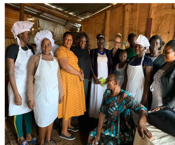
Figure 2. Market vendors in Amber court market

Mayor/Executive, Division Chairpersons, women councilors Technical Planning Committee, Municipal Development Forum, Women Councils at Municipal and Division level, Community Based Services Department. And UWEP Women Groups