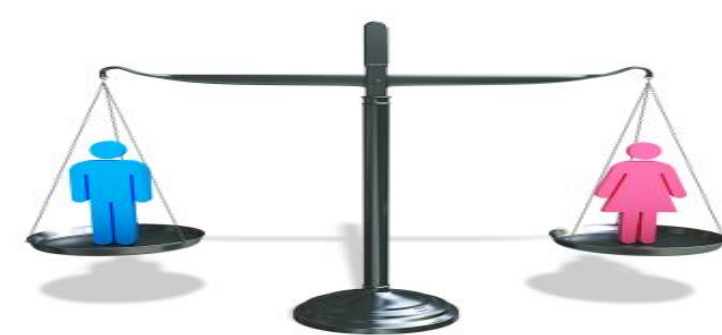
Figure 1. The photograph reflects equal participation of women and men after the change project