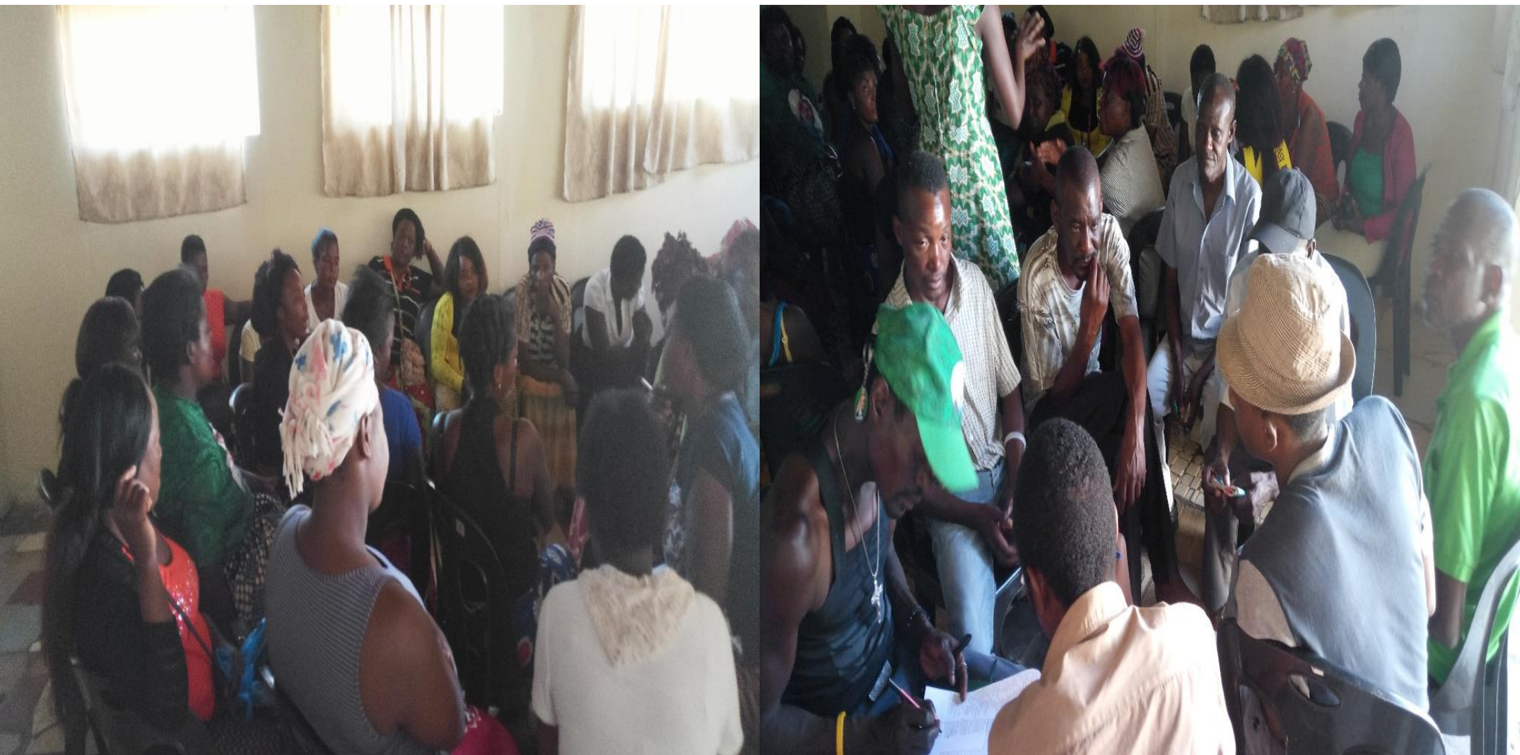
Figure 2. stakeholders meeting

Our targeted stakeholders included the political leaders of the communities (Councilors), ward development committees (WDCs), men (young and old), women (young and old), differently abled persons and council management. The method that we used to inform the communities was through the use of the Public Address (PA) system and distribution of flyers and also use of the ward development committee to send communication to the people. On the day of the meeting we segmented the population into men and women as shown below: