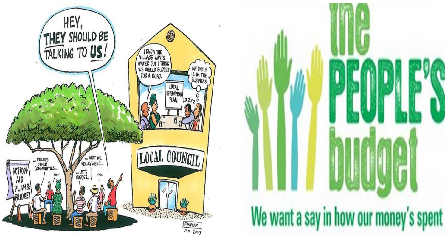
Figure 1. Picture of community.

The objective of our change project was to enhance inclusive participation in the budget process by engaging a wider range of stakeholders in project selection such as men, women and those who are differently abled in four(4) wards. These wards include Kapwepwe ward 25, Chawama ward 2, Kabulonga ward 16 and Harry Mwanga Nkumbula ward 2.