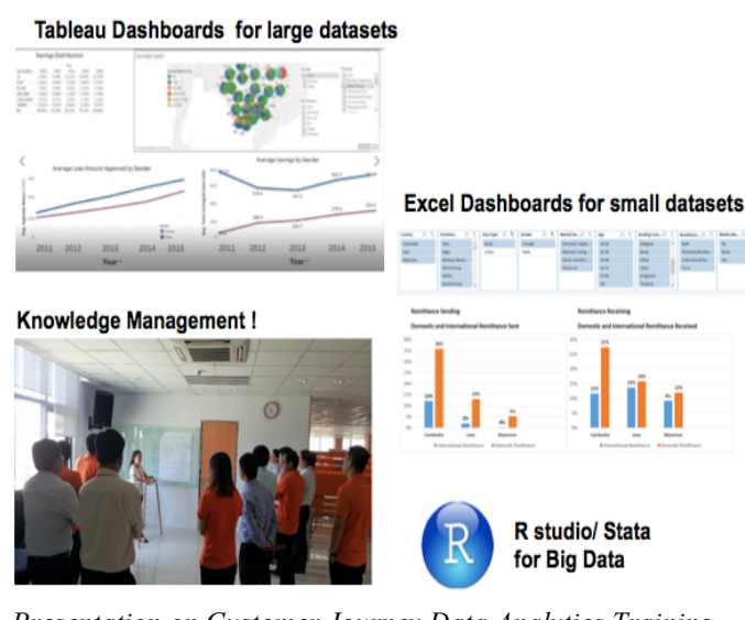
Presentation on Customer Journey Data Analytics Training

January 2017 - UNCDF Myanmar invited Financial Service Providers (FSPs) to join a workshop on Customer Journey Data Analytics, which is a UNCDF SHIFT programme that provides technical support in using data analytics for management decision-making, specifically in using customer data to better understand customer behaviour and enhance service delivery. Following other successful data workshops and trainings in the ASEAN region, the programme has decided to expand into Myanmar in 2017 in which UNCDF will offer training in data analysis and usage to capacitate the FSPs' staff to better examine clients' exist, product usage and uptake. Financial institutions are further supported through a study on customer journeys, in collaboration with research team hosted at the UNCDF and UN Pulse Lab in Jakarta.