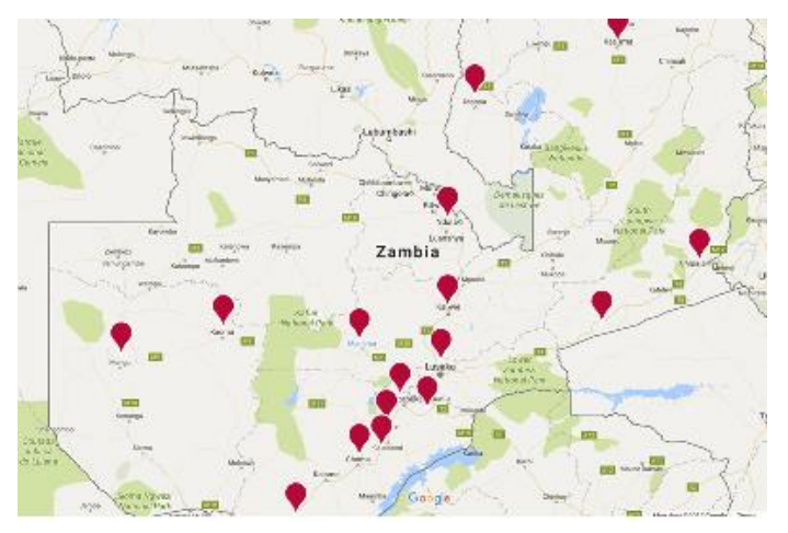
The research covered 16 locations in 8 provinces in Zambia.