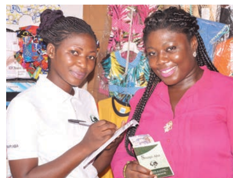
Sinapi Staff Member (left)