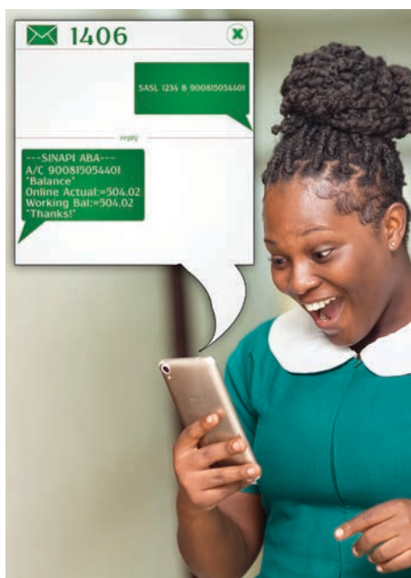
Rebranding and Marketing