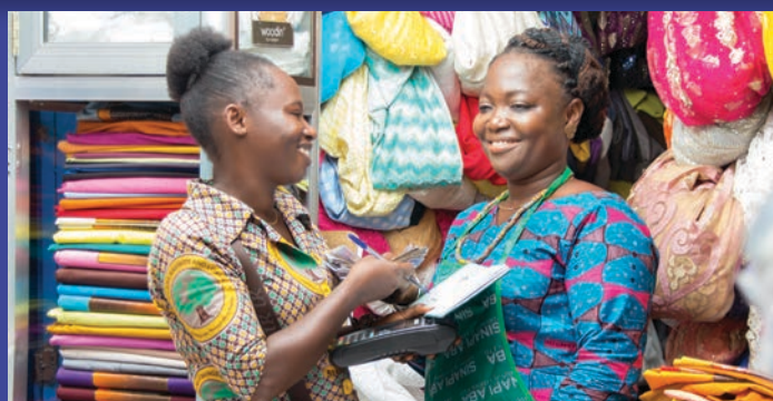
Mobile Banker with Client

The BoG began to regulate informal “Susu” collectors in 2011, leading some formal financial institutions to incorporate both these experienced financial service providers and their existing name into their banking model and staffing arrangements. 9 Sinapi’s Mobile Bankers are contracted staff who extend the traditional Ghanaian “Susu” savings collector model. Sinapi’s Mobile Bankers offer doorstep banking to micro-entrepreneurs and workers using point of sales (POS) devices, mobile phones, or simple paper technology to collect small amounts from clients directly where they work. Clients can also withdraw via Mobile Bankers, with next day cash delivery. Mobile Bankers are branded with Sinapi uniforms and identity cards, and treated as staff by Sinapi – they are not “agents” in the sense of representing Sinapi as one of many other financial or telephone companies.