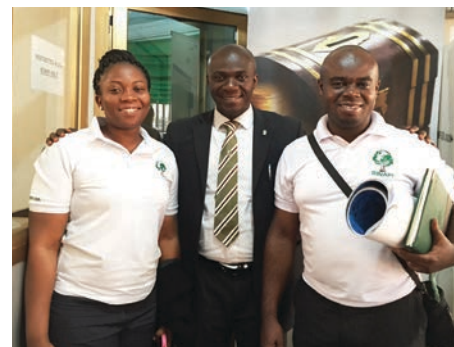
Staff in Sinapi Wear

Sinapi leaders managed the transition with a strong commitment to its staff. Unlike many institutions undergoing major restructuring (and against external advice), Sinapi leaders made a commitment to maintain and retrain staff during the conversion rather than hire in external banking talent. This strategy required a significant investment in training and human resource development. With UNCDF MicroLead support, Sinapi invested heavily in staff reorientation, training, and redeployment. A number of external bankers were hired in senior positions, but they work under existing senior management rather than replacing them. In spite of dramatic changes and a more business-like work atmosphere, Sinapi maintained its organizational culture as a “large Christian family.” Even Sinapi’s Mobile Bankers – who work on contract – carry the Sinapi brand and are welcomed as staff members. This HR strategy appears to have paid off: in the 2015 Customer Survey, Sinapi staff performance was the most highly rated of any category (receiving scores of 4.3 and 4.4 out of 5).