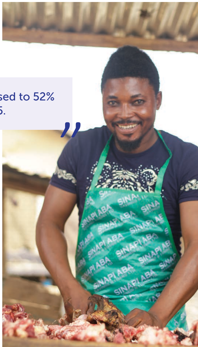
Evidence of Success - Client Photo

Despite these successes, Sinapi still operates on the margin of profitability, just breaking even on return on assets with operational self-sufficiency of 96% (December, 2015).