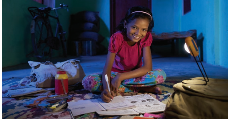
Solar energy provides lighting for evening studies